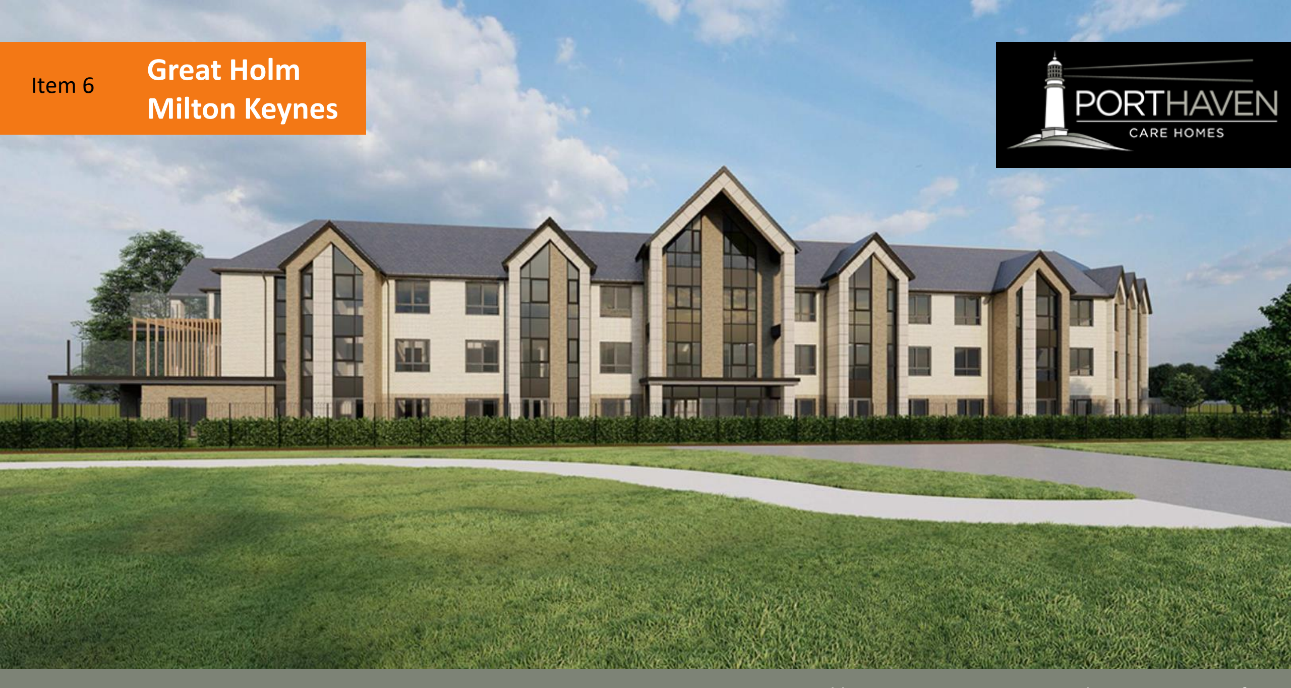
February 2022 Update