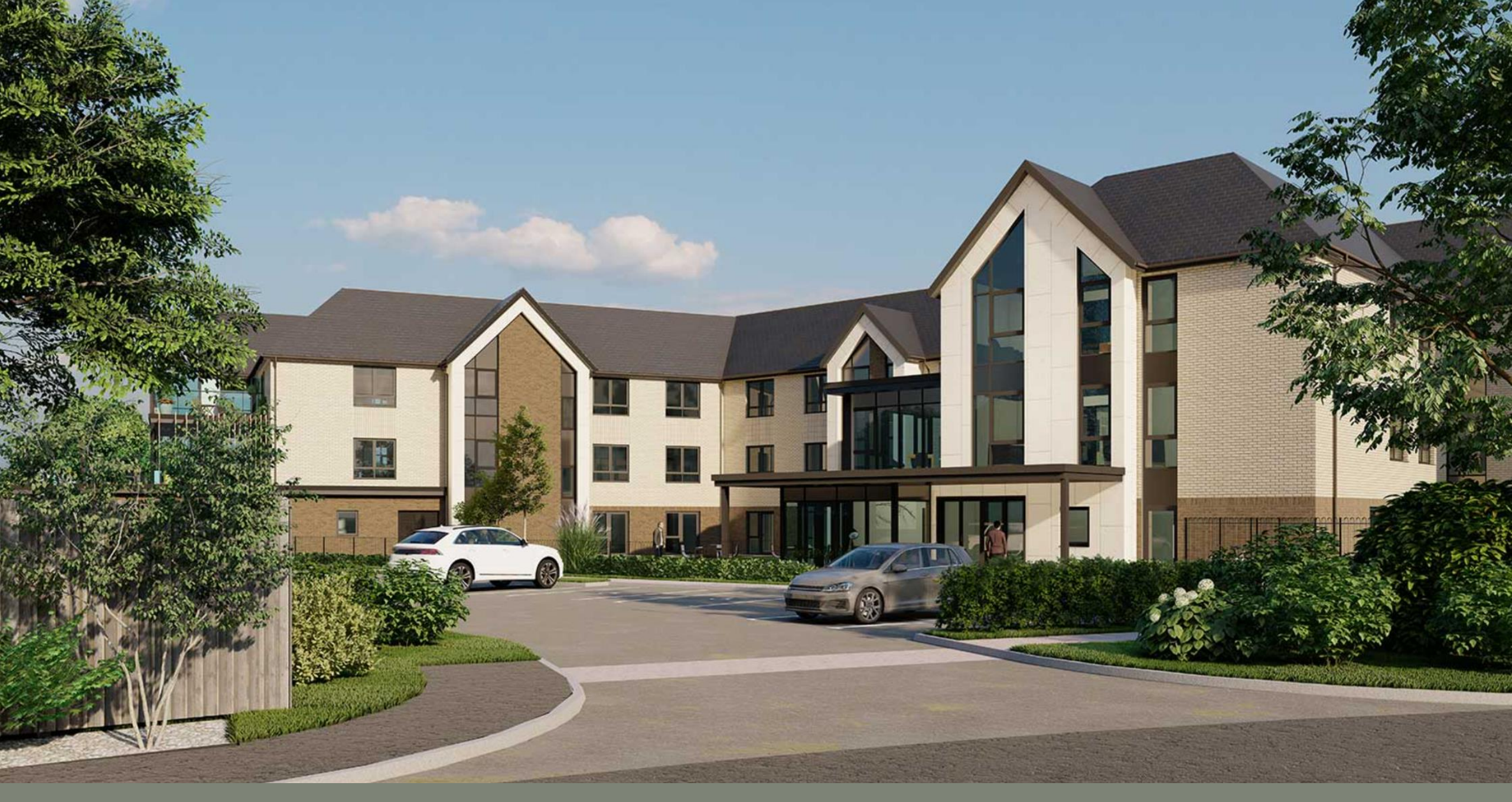
February 2022 Update I CGI view of the rear of the care home