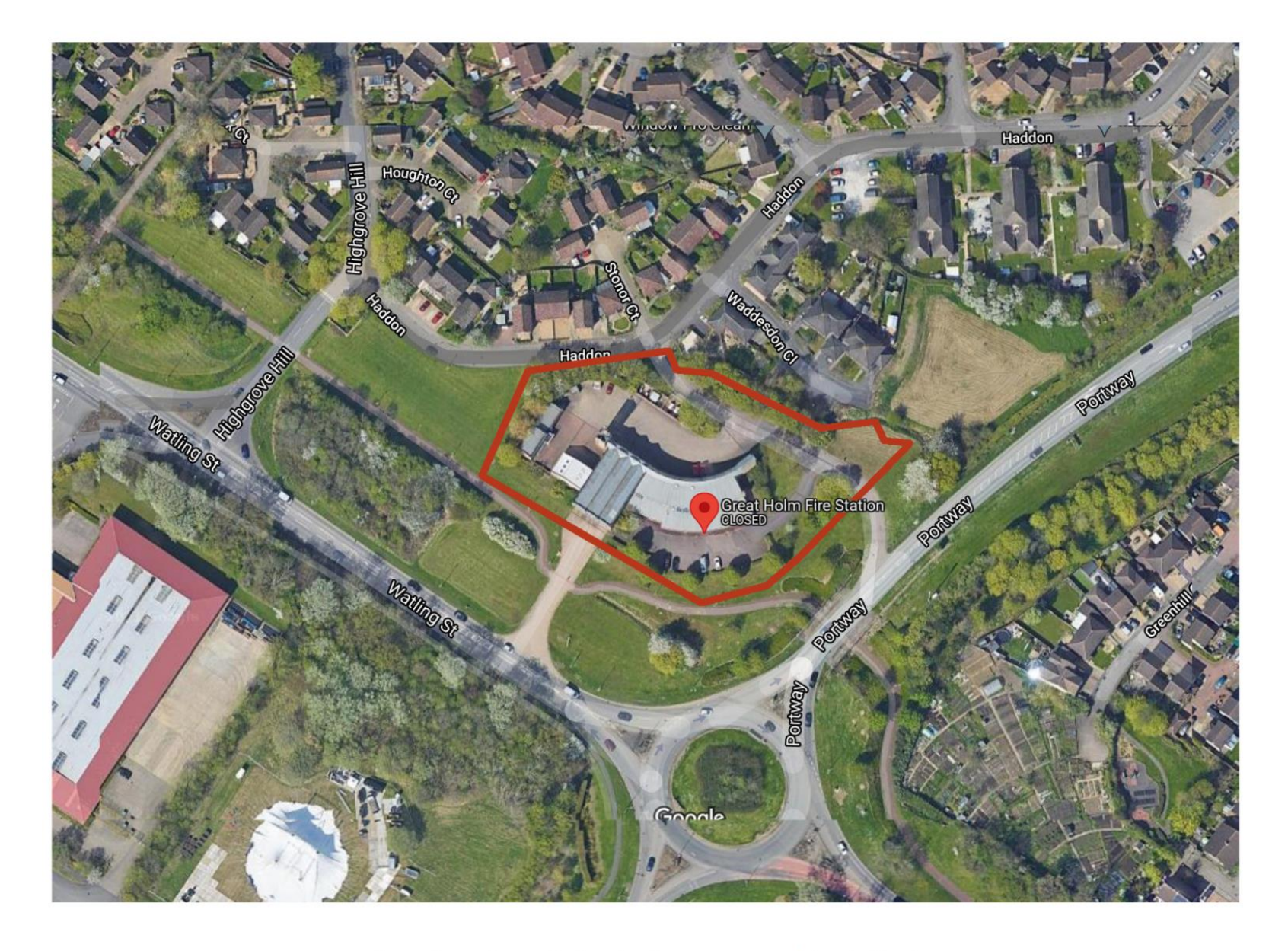
Above: Approximate site location